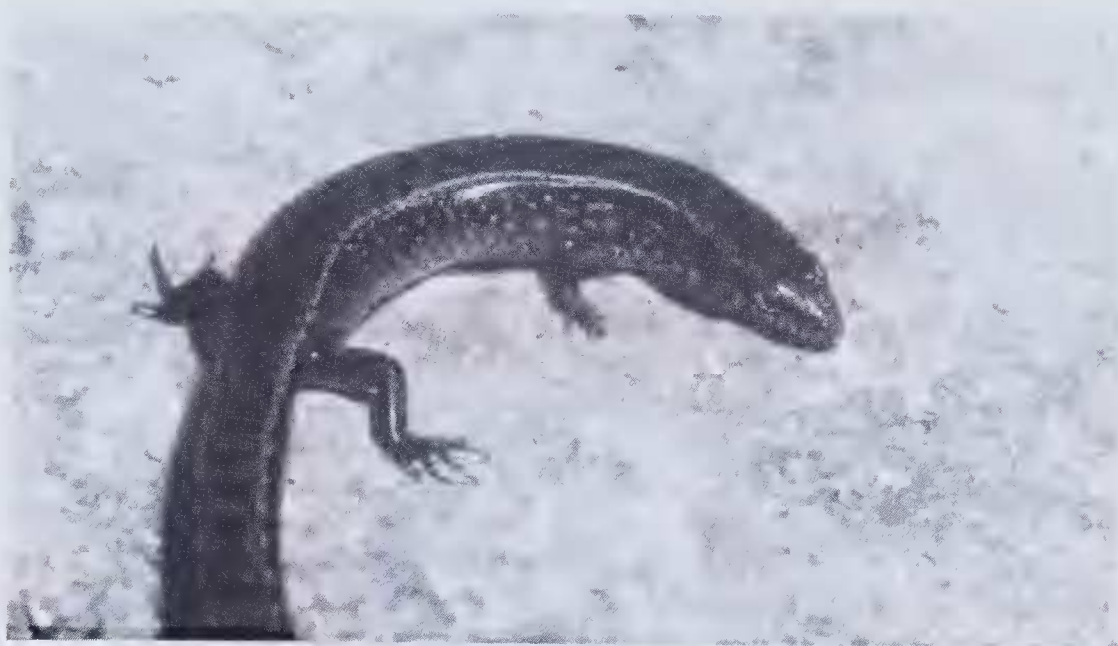
Figure 4 A Glaphyromorphus emigrans (R101859) from Ngallu, East Sumba photographed in life by N.A. Cooper.

similarity in body form and head scalation between G. butlerorum and such taxa as G. emigrans and G. antoniorum .